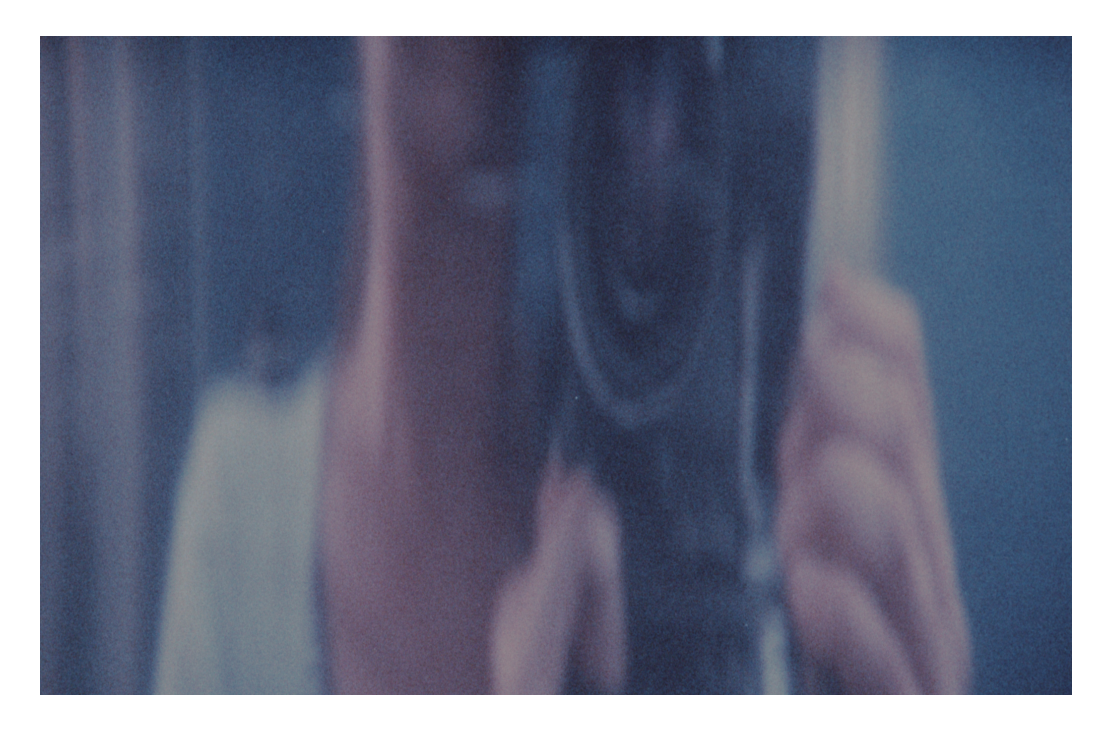
Figure 1.2: Chrome Reflection (Still)