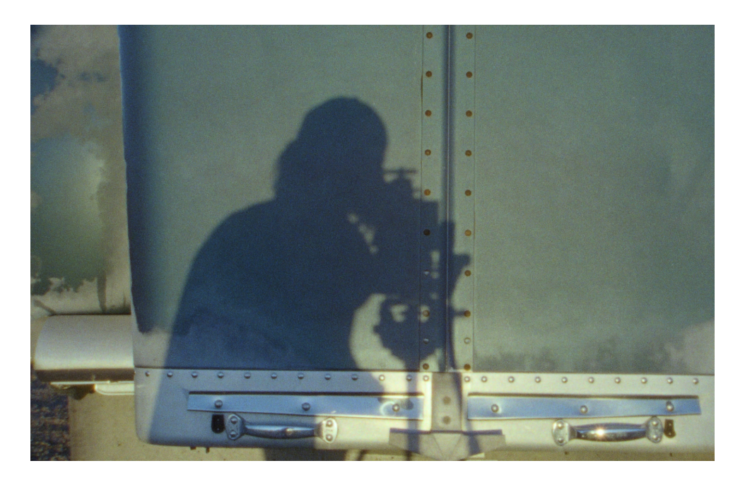
Figure 1.1: Truck and Me (Still)