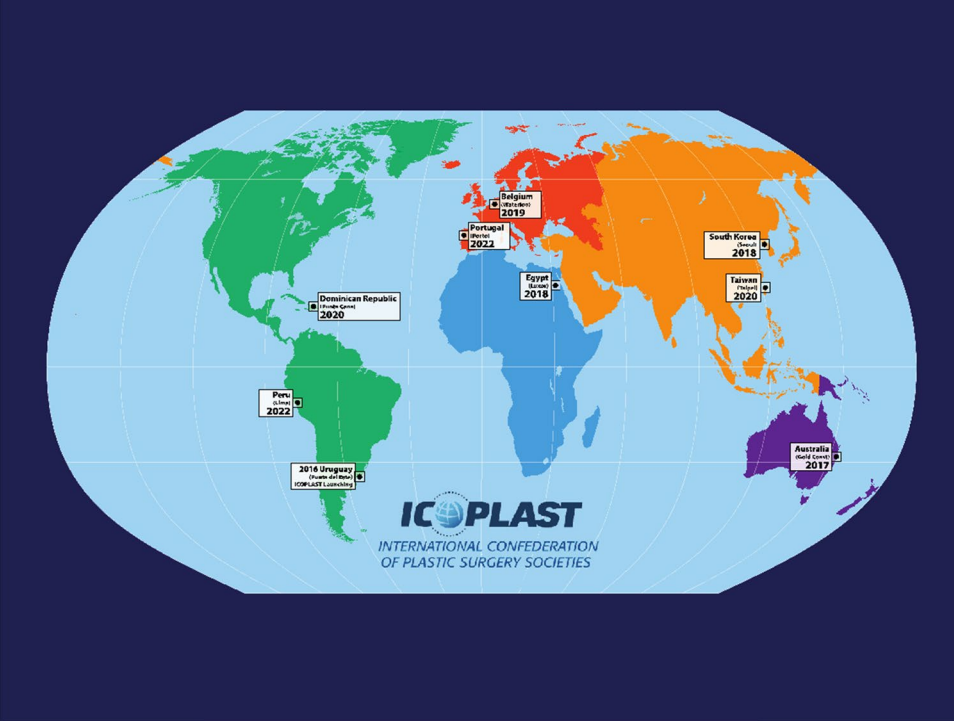
Fig. 3 Five continents of past and future symposia and meetings

Besides our upcoming World Congress, we are also planning the first ICOPLAST Day to be held on the 4th of October, a day before the European Society of Plastic Reconstructive and Aesthetic Surgery (ESPRAS) Quadrennial Congress 2022, in Gaia-Porto, Portugal. This represents the first educational collaboration between ICOPLAST and ESPRAS, the umbrella organization of all EU national societies (Fig. 3).