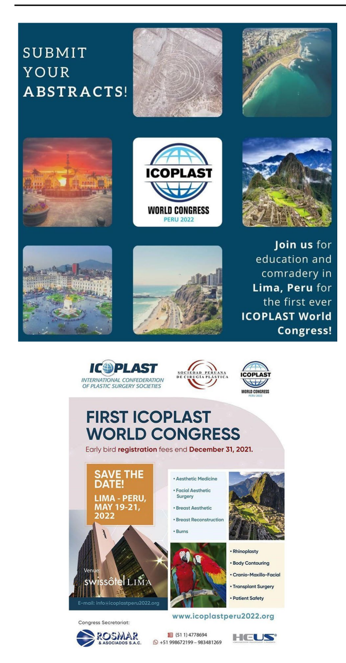
Fig.4 Electronic flyers to promote the first ICOPLAST World Congress ever