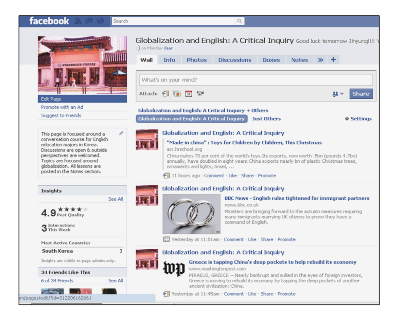
Figure 3. Course Facebook Fan Page

One of the main requirements for the course was participation on the class Facebook Fan Page (see Figure 3 ). At the beginning of the term students were asked to register for Facebook. Security and privacy issues were explained in detail and they were encouraged to use pseudonyms and keep the information on their personal Page minimal for comfort purposes. Interestingly, all of the students chose to use their real names. Only 7 out of 30 students already had a Facebook account. During the second lesson students were given a ten