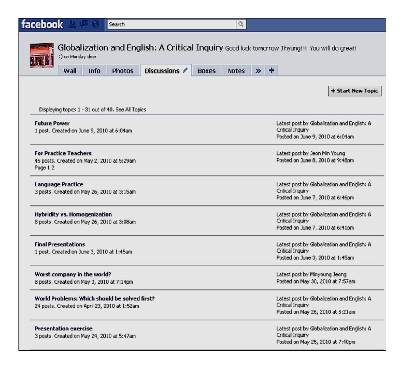
Figure 4. Course Facebook Page: Discussions Section

community may upvote or downvote the story. Stories with the most upvotes appear at the top of the page. As a reddit member, I find the model of discussion on the website as near an ideal of democratic discussion as might be found on the internet. The community seems committed to in-depth, open-minded debate. The site possesses its own set of rules, known as