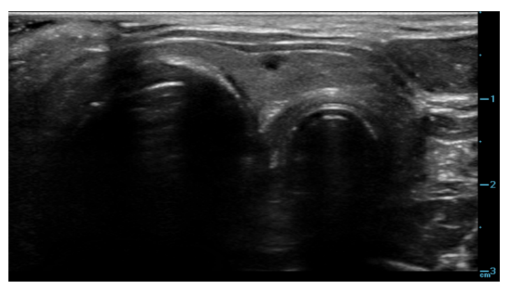
Figure 2. Esophageal intubation.