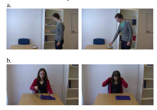
Figure 1: Sample frames from the two videoclips (a) 'man takes banana from shelf' and 'man puts banana on plate'; (b) 'woman takes necklace from bag', and 'woman puts necklace on.'

neck. Across episodes, the camera angle and position of the actor in the room were kept constant.