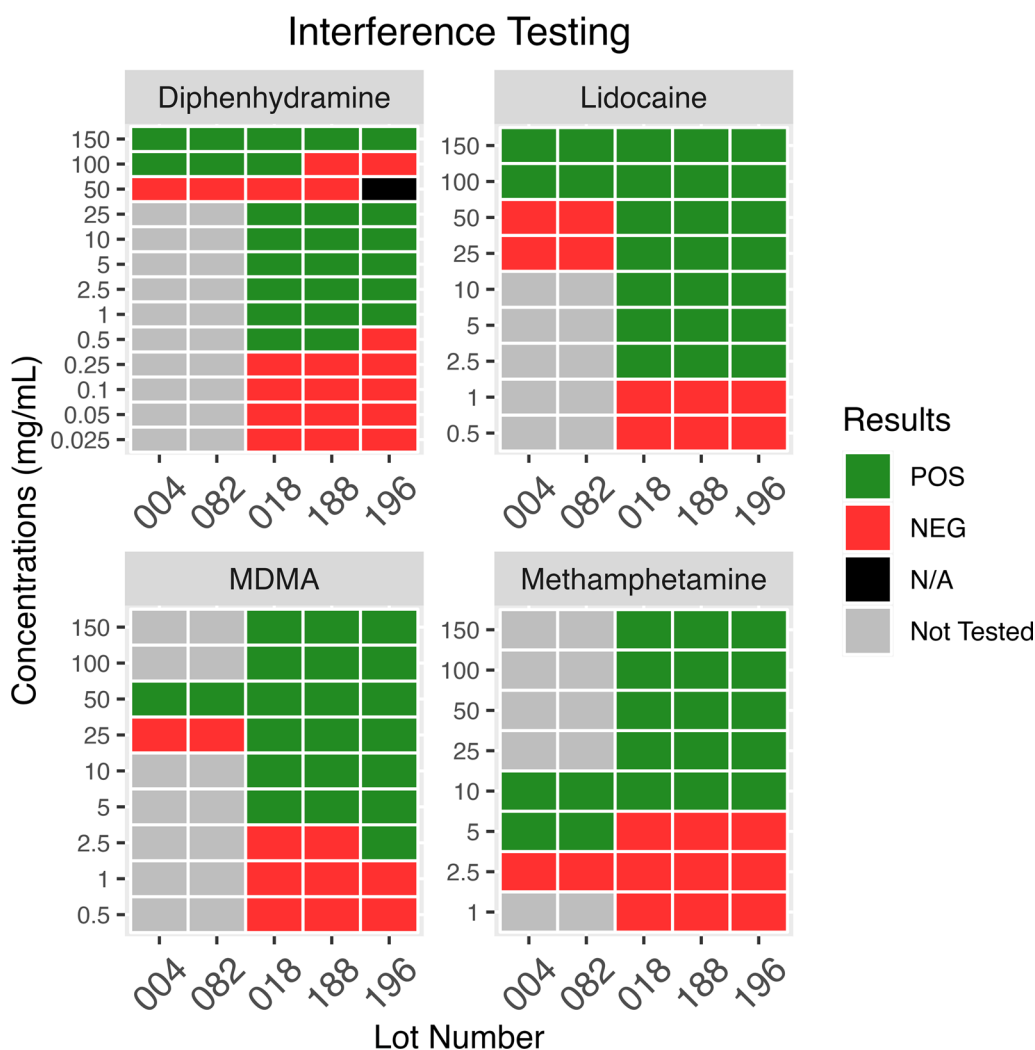
Fig. 2 Fentanyl test strip reactivity with interferences. BTNX Rapid Response Fentanyl Test Strip (20 ng/mL cutoff) limits of cross-reactivity for interferences. POS indicates a positive result, NEG indicates a negative result, N/A indicates a lack of control line on multiple tests indicating an invalid test, and Not Tested indicates concentrations not evaluated

false-positive BTNX-20 results at 100 mg/mL for the 2017 lots, with false positives occurring at more realistic testing concentrations of 2.5 and 0.5–1 mg/mL for the 2021 lots, respectively. However, at the higher concentrations of diphenhydramine (beyond realistic testing concentrations), we observed repeated paradoxical results with the 2021 lots.