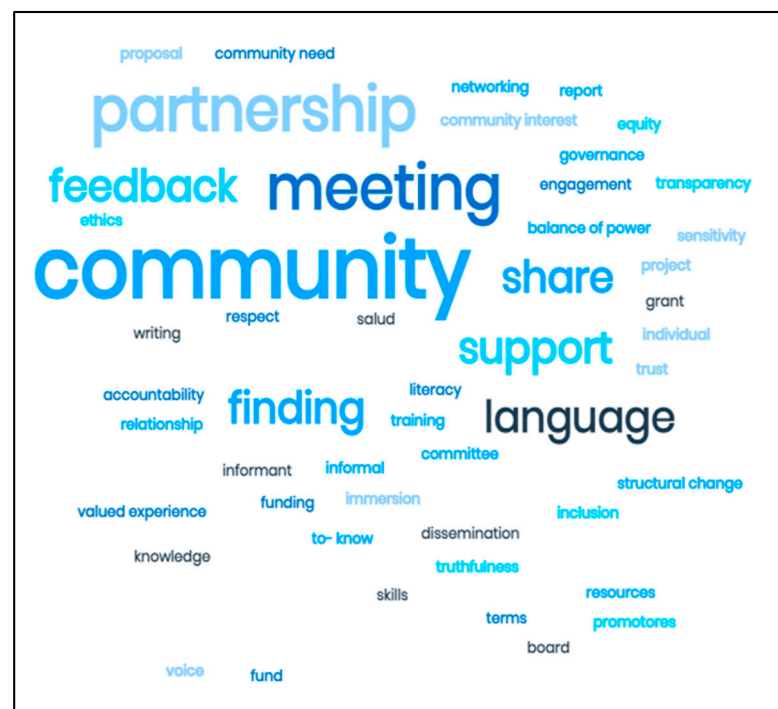
Figure 3. Word Cloud Associated with Community Trust.

The word cloud in Figure 3 captures many of the concepts derived from our findings that are crucial to the work we do collaboratively within our communities. The most frequently mentioned words in the qualitative findings appear largest in the cloud, and include community, partnership, meeting, language, feedback, support, share, and finding. The prominence of these words reflects respondents’ views that community and partnership must be central to all community engaged endeavors, that meetings (which take time) are essential for sharing and feedback, and that the community must be supported and see that researchers hear their voices.