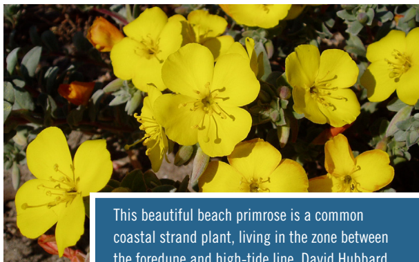
This beautiful beach primrose is a common coastal strand plant, living in the zone between the foredune and high-tide line. David Hubbard