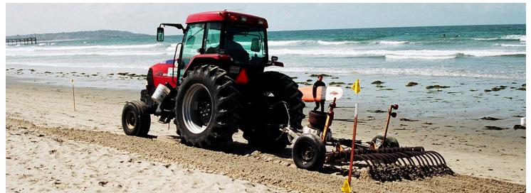
A tractor outfitted with a large metal rake removes wrack from the beach.