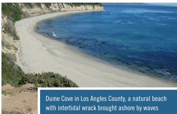
Dume Cove in Los Angeles County, a natural beach with intertidal wrack brought ashore by waves and tides. David Hubbard