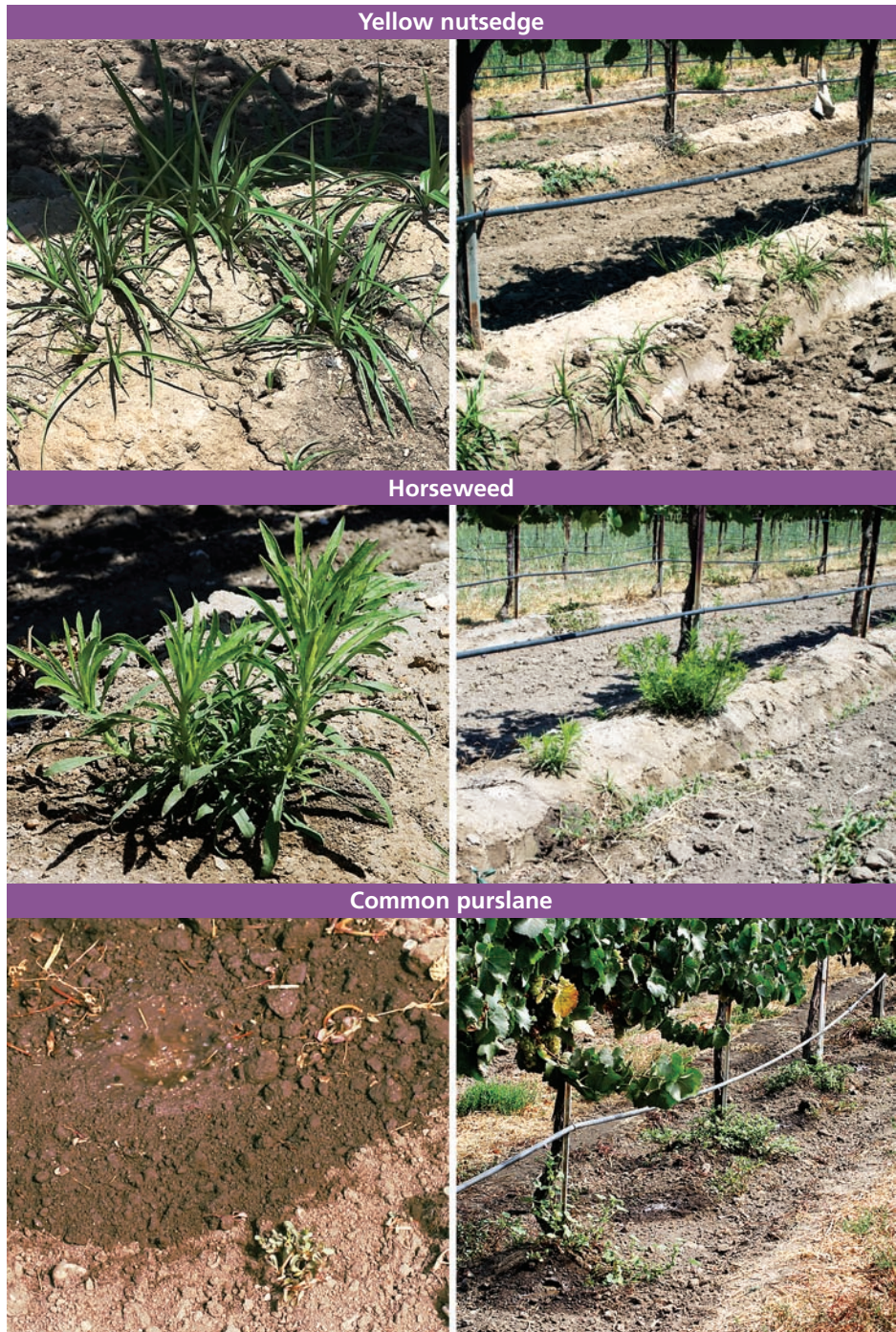
To assess the effectiveness of various vineyard floor management strategies, the authors compared pre- and post-emergence herbicide treatments with cultivation in the rows, and several different cover crops in the middle. The primary weeds in the Monterey County vineyard were yellow nutsedge, horseweed and common purslane.

* Values within a column followed by the same letter are not different (Fisher's protected LSD test, \alpha = 0.05 ).