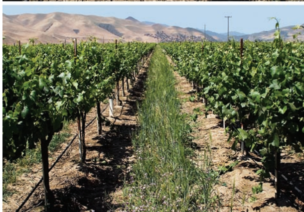
Vineyard floors are managed to prevent competition from vegetation that can inhibit grape yields and quality. Top , cultivated bare ground in the row middle; bottom , a cover crop.

Growers along California's Central Coast are under increasing pressure to keep herbicides from contaminating groundwater, and in turn, the Monterey Bay and National Marine Sanctuary. In vineyards, weed control generally consists of both pre- and post-emergence herbicide applications. The common pre-emergence herbicide simazine has been identified as a contamination risk for groundwater. This project was initiated to compare the long-term effects of floor management practices and alternative weed-control strategies on vineyard productivity over five growing seasons (2001 to 2005). In addition, we evaluated the associated economics over four growing seasons (2002 to 2005).