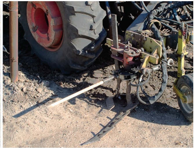
There were no differences in vine growth, crop yields or fruit composition among all the weed control treatments in the 5-year study, demonstrating that vineyard floors can be managed effectively without high-risk herbicides. For the cultivation treatment, above , the Radius Weeder inserts a knife into the soil to sever weed shoots from their roots.

cumulative cash costs, ranging from $899 to $1,032 per acre over the 4-year study period (fig. 2B). The pre-emergence treatment had the next highest cumulative cash costs, ranging from $555 to $690 per acre. The post-emergence treatment was least expensive, at $498 to $633 per acre.