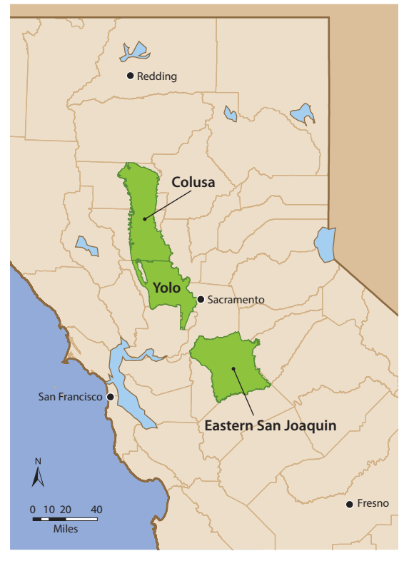
FIG. 1. Case study groundwater basins.

decision-making within the GSA or in coordination at the basin scale.