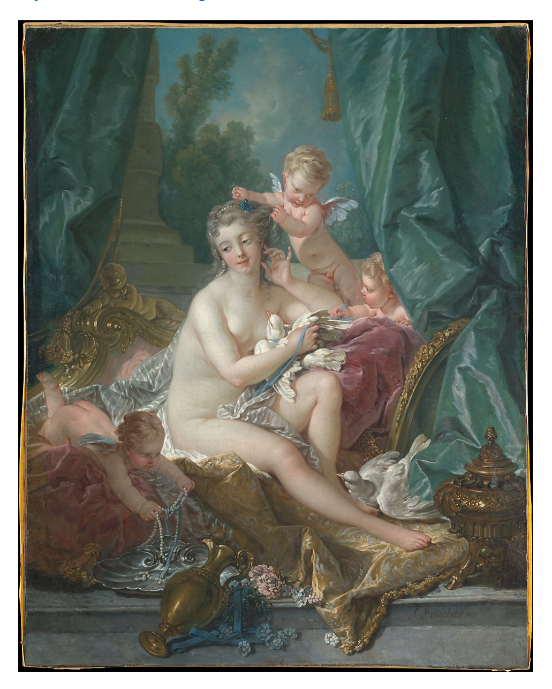
Fig. 1 Boucher, François. The Toilette of Venus . 1751. Oil on canvas. 42 5/8 x 33 ½ in. Metropolitan Museum of Art, New York. <u>https://www.metmuseum.org/art/collection/search/435739</u>