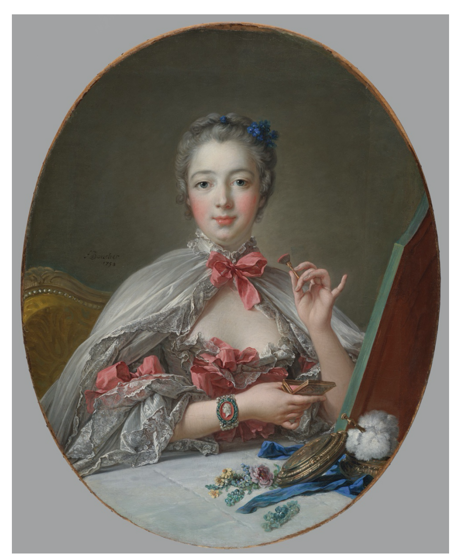
Fig. 3 Boucher, François. Pompadour at Her Toilette, Formerly Jeanne-Antoinette Poisson, Marquise de Pompadour . 1750. Oil on canvas. 39 5/16 x 33 ¼ in. Fogg Museum, Cambridge. <u>https://hvrd.art/o/303561</u>.