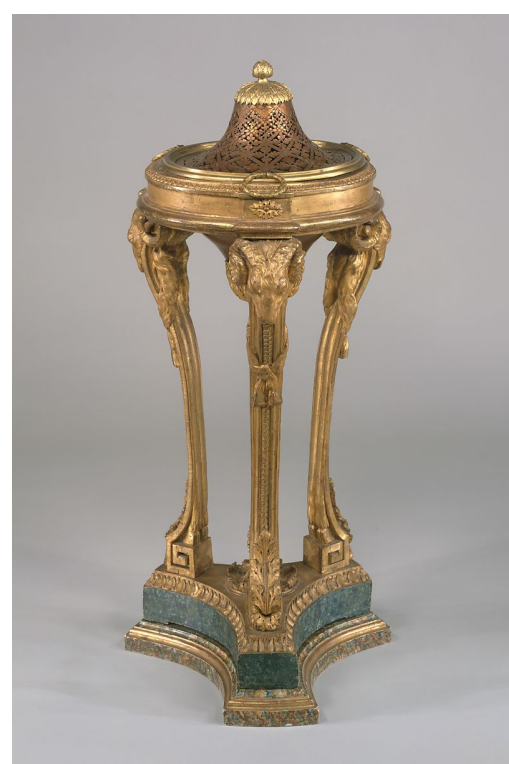
Fig. 7. Incense Burner (Brûle-Parfum) . 1775. Woodwork. French. Metropolitan Museum of Art, New York,

https://www.metmuseum.org/art/collection/search/207392.ollection/search/436918.