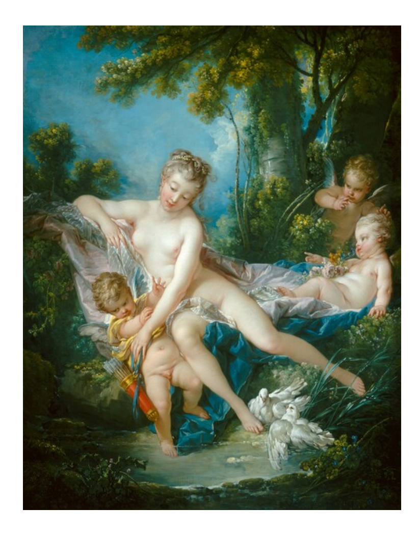
Fig. 4 Boucher, François. The Bath of Venus . 1751. Oil on canvas. 107 x 84.8 cm. National Gallery of Art, Washington DC. https://www.nga.gov/collection/art-object-page.12200.html