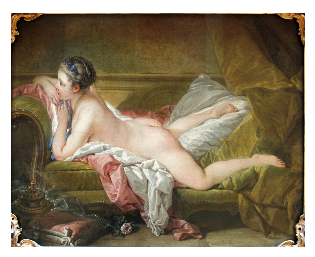
Fig 12 Boucher, François. The Blonde Odalisque , 1752, oil on canvas, unknown dimensions, Alte Pinakothek, Munich.