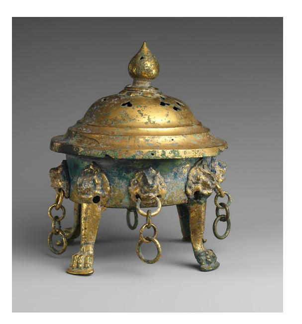
Fig. 9 Tripod Censer with Chi-Dragon Handles and Lion-Dog Knop on Openwork Cover . Qing dynasty. Bronze. Saint Louis Art Museum, Saint Louis. <u>https://www.slam.org/collection/objects/43367/</u>.

Fig. 8 Alicia M. Priore, "François Boucher's Designs for Vases and Mounts," Studies in the Decorative Arts 3, no. 2 (1996): 2–51, http://www.jstor.org/stable/40662567.