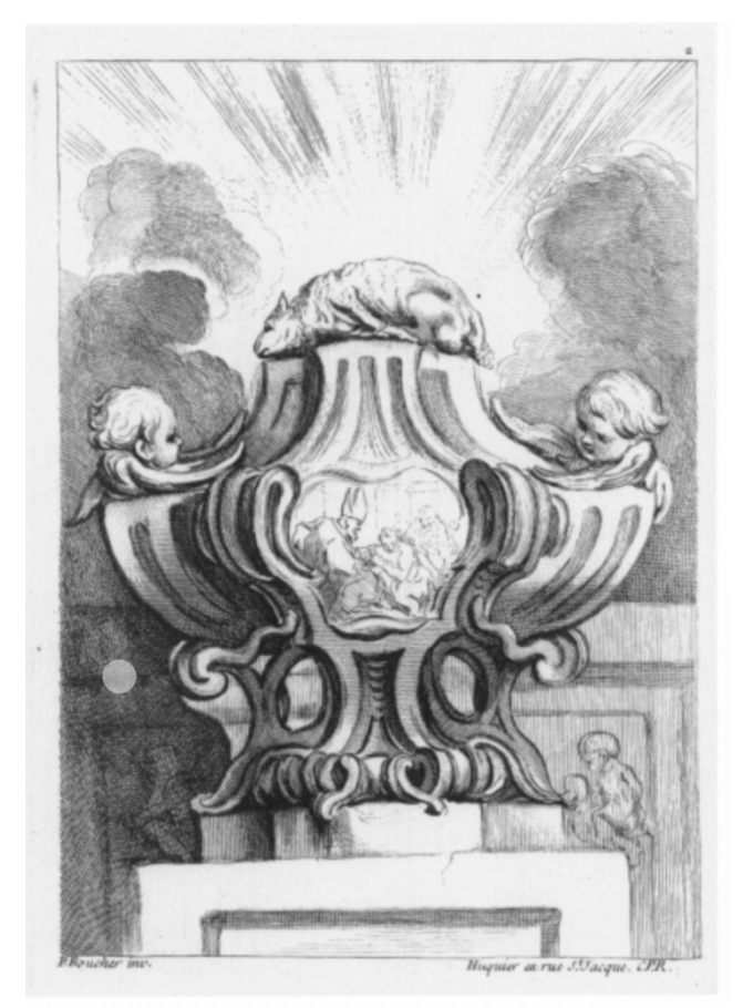
Fig. 8 Alicia M. Priore, "François Boucher's Designs for Vases and Mounts," Studies in the Decorative Arts 3, no. 2 (1996): 2–51, http://www.jstor.org/stable/40662567.

Fig. 9 Tripod Censer with Chi-Dragon Handles and Lion-Dog Knop on Openwork Cover . Qing dynasty. Bronze. Saint Louis Art Museum, Saint Louis. <u>https://www.slam.org/collection/objects/43367/</u>.